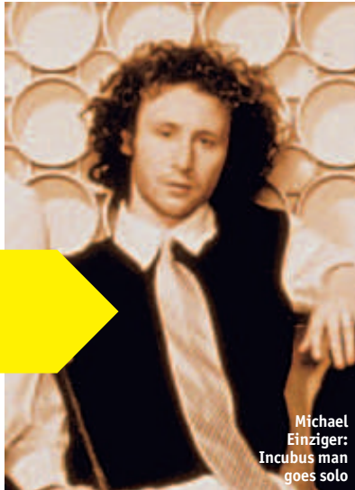
Michael Einziger: Incubus man goes solo

All-girl outfit who pound out dirty, heavy guitars and kickass vocals